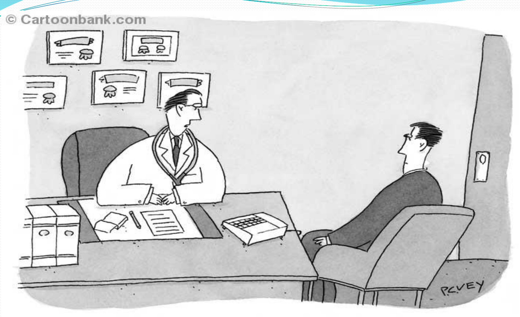
"There's no easy way I can tell you this, so I'm sending you to someone who can."